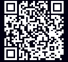
TRB143 360° VIEW