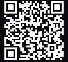
OTD500 360° VIEW

The OTD500 is a durable 5G outdoor router built for reliable connectivity in demanding environments. Its IP55-rated housing withstands harsh conditions, and the integrated mounting bracket enables quick, hassle-free installation. Dual SIM and eSIM with automatic switching provide exceptional network flexibility and redundancy. Gigabit Ethernet ports with PoE-in and PoE-out simplify setup by combining power and data in a single cable. Fully RMS-compatible, the OTD500 offers effortless remote management, making it perfect for outdoor connectivity solutions.